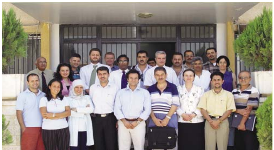
The participants of the Management Workshop

We always look forward to your constant participation and welcome your comments and suggestions.